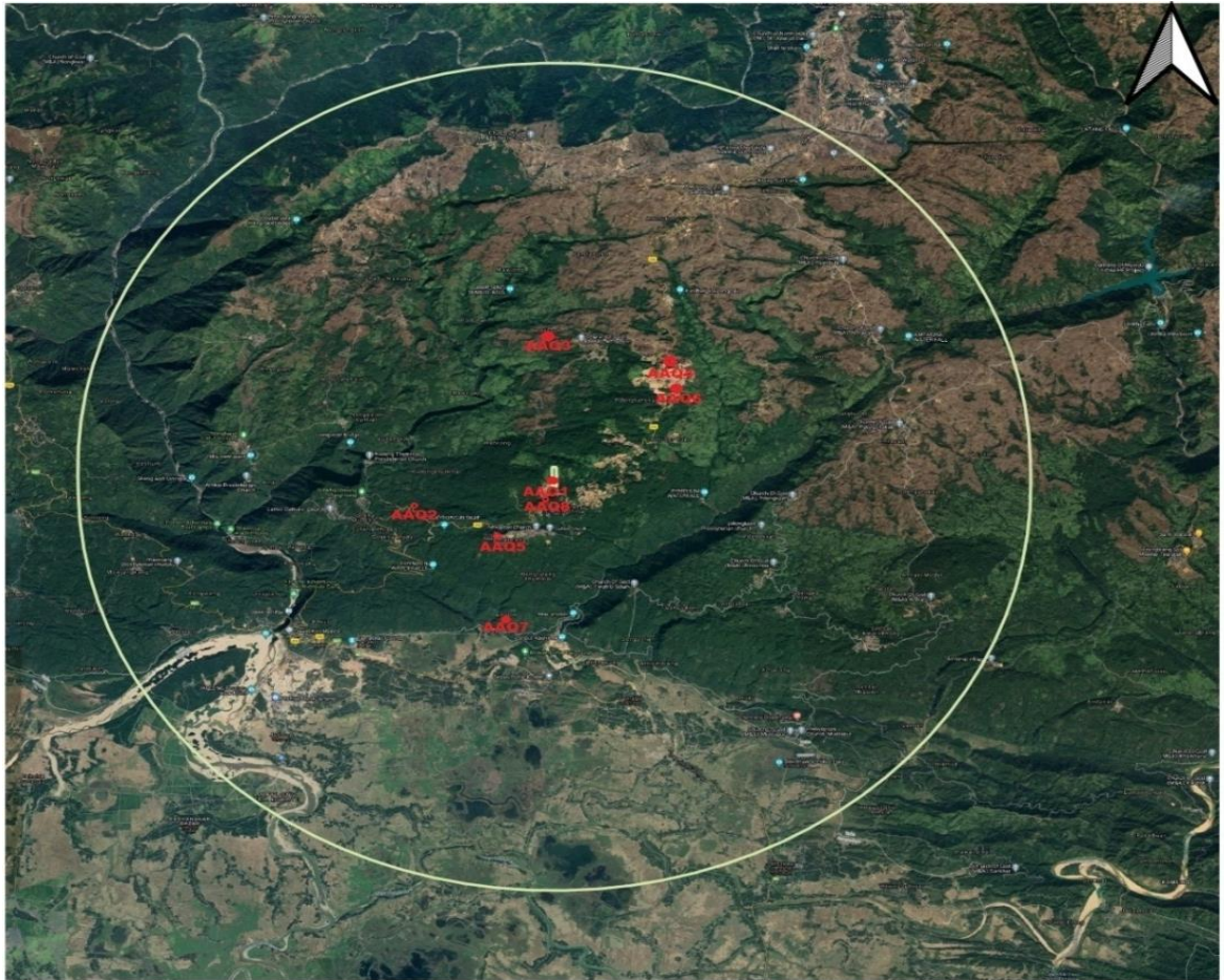
Figure 2 10 km Radius Map around the Project Site